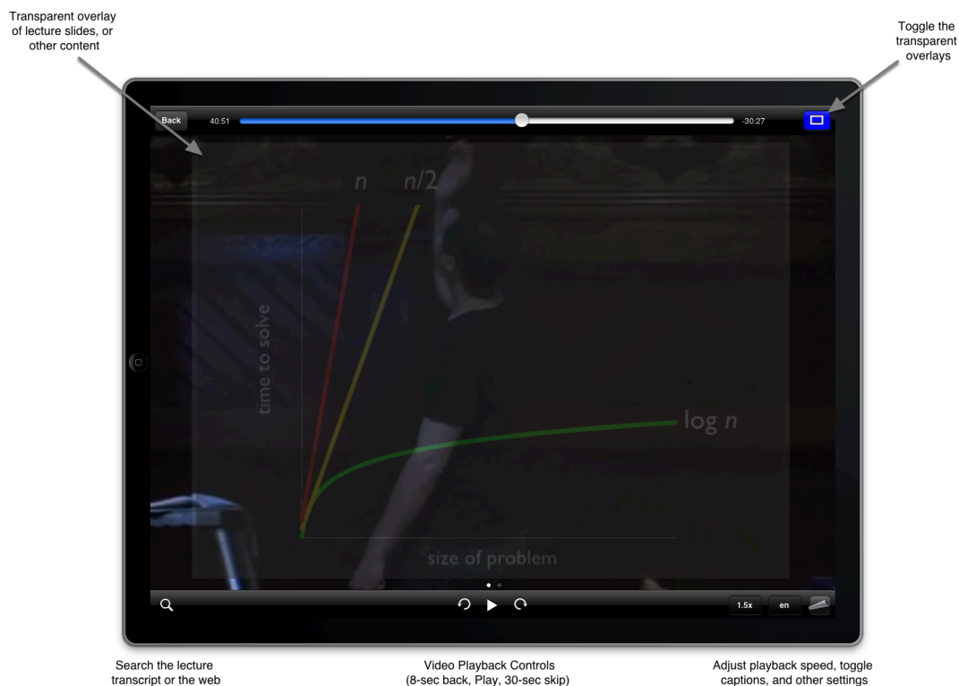
Figure 2: CS50 Video's iPad player offers an immersive experience in which students can view overlays with supplementary material as well as search transcripts and the web.

questions were recorded across 35 videos; 61.3% of these responses were correct answers. Although the semester is still in progress, we were disappointed with some of these early results, particularly the relatively low percentage (28%) of students who've engaged with CS50 Video's interactive assessments. Vis-à-vis alternative players, it is possible we overcorrected with CS50 Video's design, placing too much control in students' own hands, whereby it is now too easy to overlook available questions. At the same time, we suspect students might not perceive sufficient value in answering questions, given that responses are recorded but not graded for credit. We intend to experiment further with alternative interfaces that might lend themselves to more active engagement.